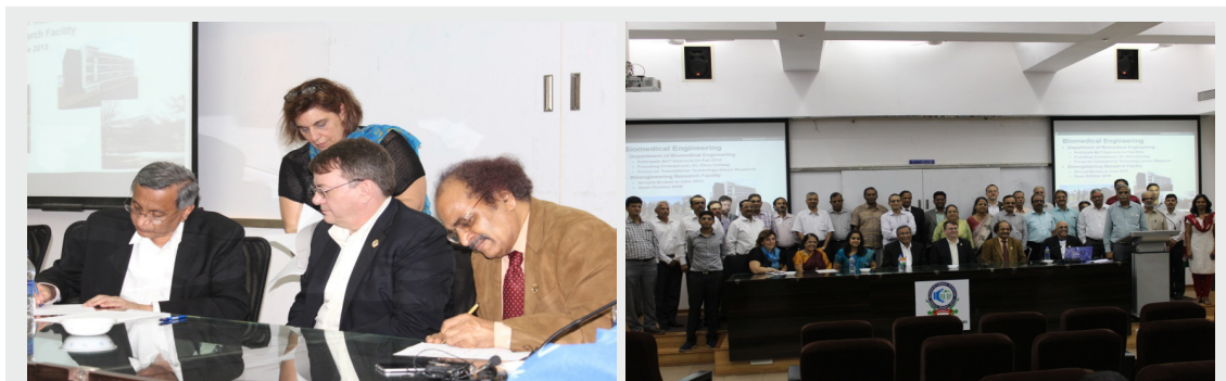
MOUs with BPCL and HPCL

Tel Aviv University, Technion and Hebrew University on November 17, 2016 Dual Degree Ph.D. programme MOU with Michigan State University January 16, 2017