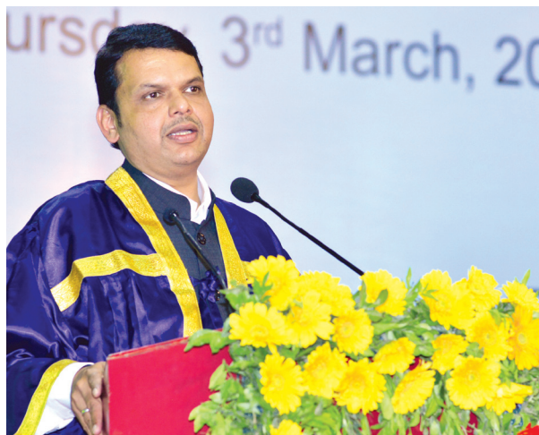
Shri. Devendraji Fadanavis Chief Minister, Government of Maharashtra

(Tutari is played before the CM's speech)